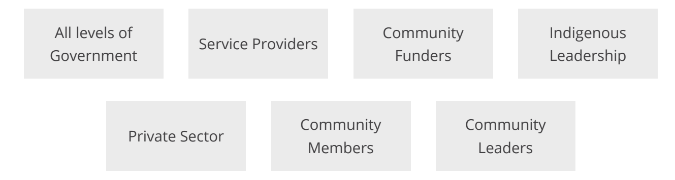
Figure 5: Steering Committee Stakeholders

Ideally, committee members are leaders from government and non-profit sectors, including public systems, community funders, the private sector and community. Membership should consist of representatives of key funders and public systems essential to ending youth homelessness, such as child protection, social services, education, corrections, health, etc. Members should include both on- and off-reserve Indigenous leadership, government representatives, those with lived experience, researchers and community members at large. For rural and remote communities, you will need to balance the representation regionally.