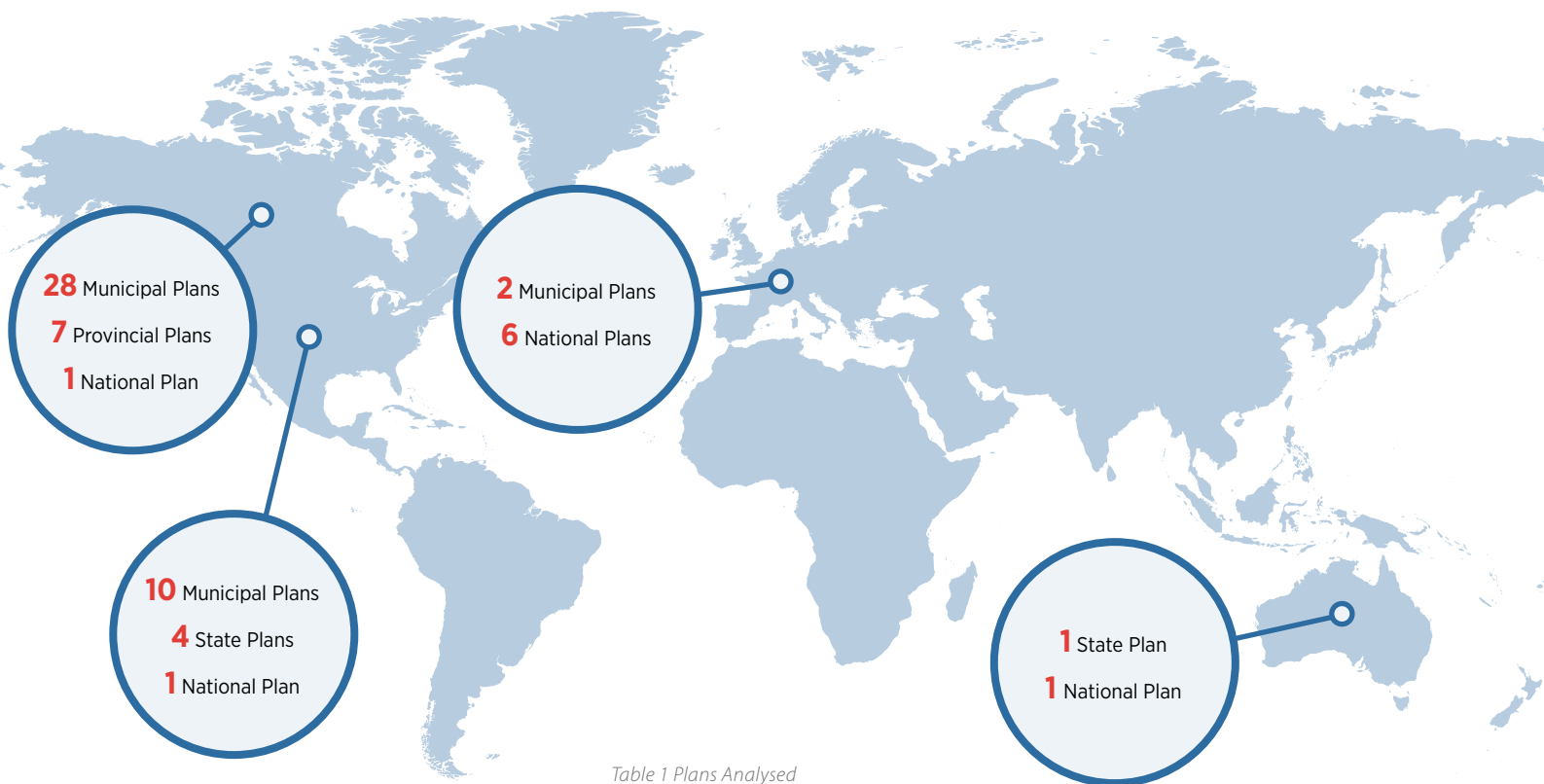
Table 1 Plans Analysed

The conceptual framework developed as result of this work was presented at the Canadian Alliance to End Homelessness conference in November 2015; feedback from experts on performance measurement in Canada and the U.S. obtained during the session was incorporated into this paper as well.