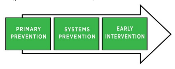
Diagram 1: A Framework for Preventing Youth Homelessness

The framework presented here focuses on three interconnected domains related to youth homelessness prevention: primary prevention , systems prevention , and early intervention . As will be seen, prevention necessarily involves addressing the personal and structural factors that contribute to a young person's homelessness.